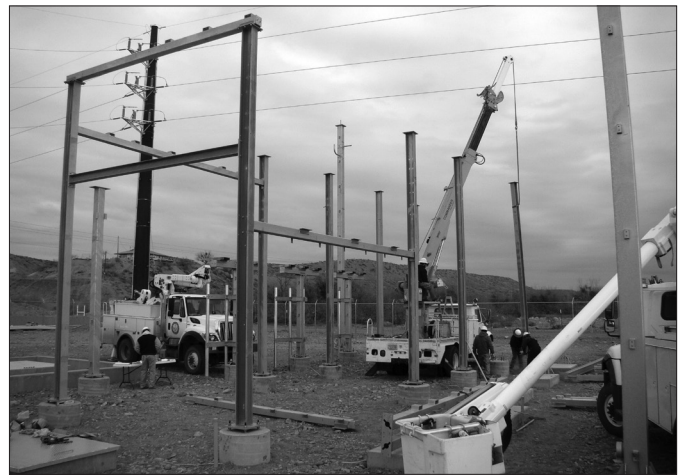
A Graham County Electric Cooperative line crew works on the Talley Substation.

For the past 15 years, your co-op has been aggressively upgrading the power grid, which includes new lines, pole change-outs, new equipment, and upgrading or adding additional substations. The crews have worked tirelessly and have completed many of the improvements needed for electric loads and