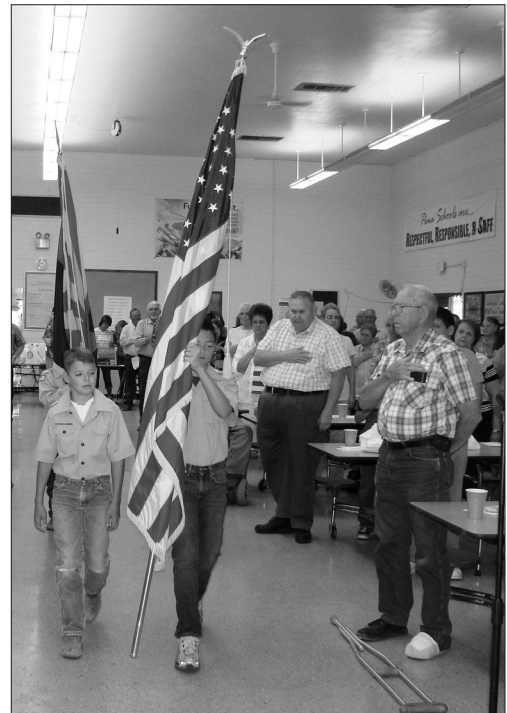
Pima's Boy Scout Troop 5229 presenting colors at 2012 GCU annual meeting.