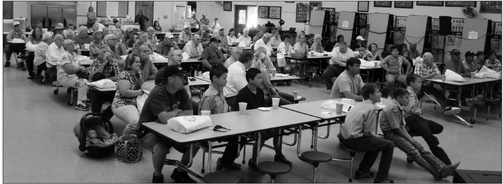
Members look on during the 2012 annual utilities meeting.

AZ-145 Postmaster: Send address changes to Currents, 2210 S. Priest Dr., Tempe, AZ 85282-1109