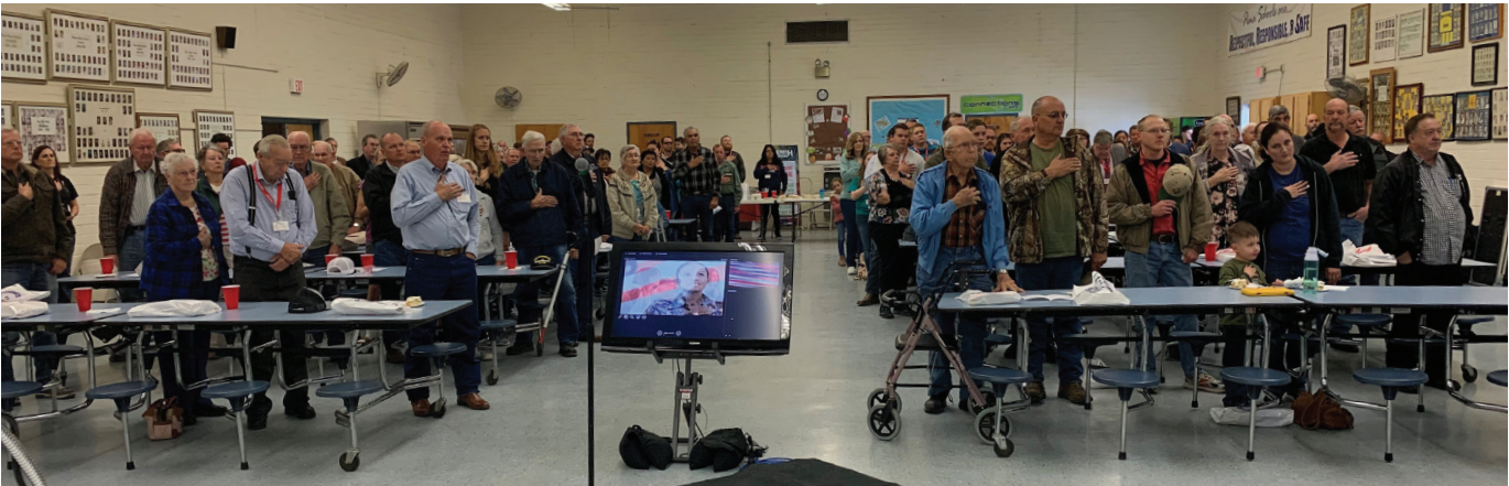
The 2021 annual meeting will look a little different than in past years due to COVID-19 safety measures.