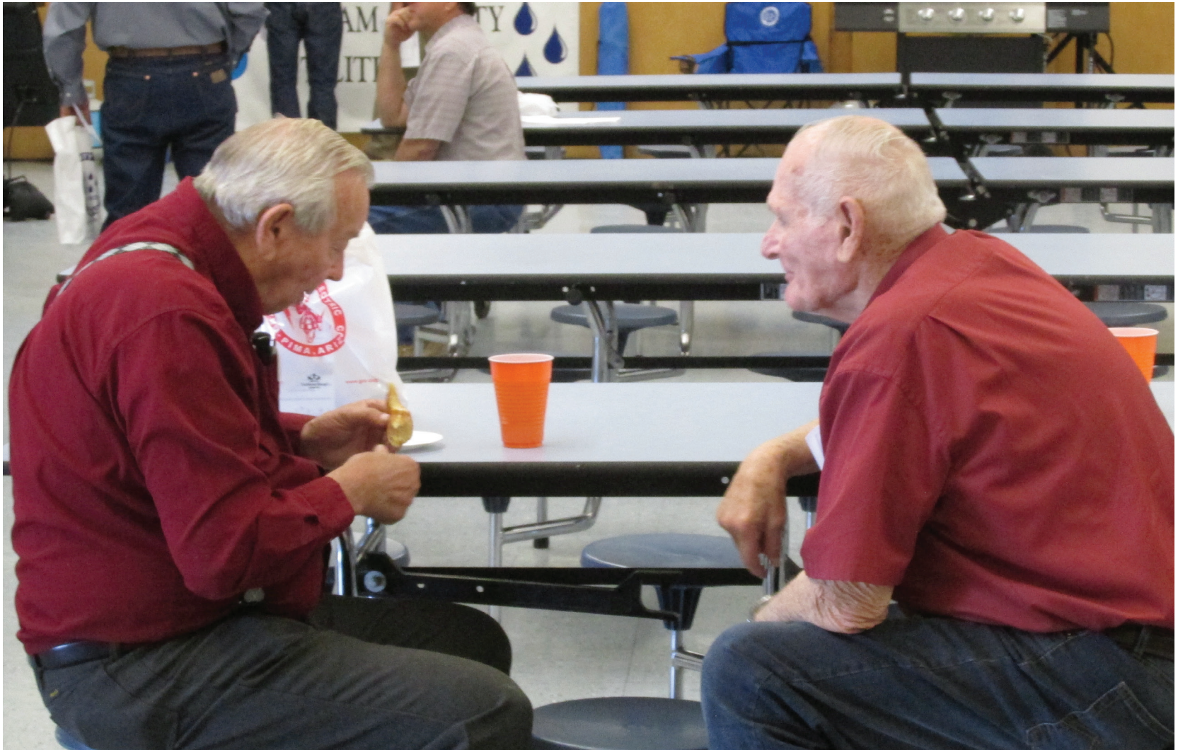
Friends catch up during a past Graham County Electric Cooperative annual meeting. Stay tuned for more information about the upcoming joint annual meeting in September.